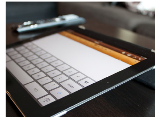
SAP runs SAP

SAP deploys 25,000 smart phones, and 14,000 tablets to employees worldwide.