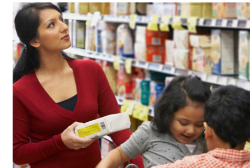
Enabling affordability in retail

Imagine a new paradigm in which businesses can run without warehouses or offices. Imagine fully engaged employees and partners collaborating seamlessly to anticipate and respond to customers in real-time.