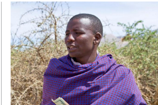
Banking for the unbanked

Our solutions are uniquely pre-packaged for rapid deployment without disruption.