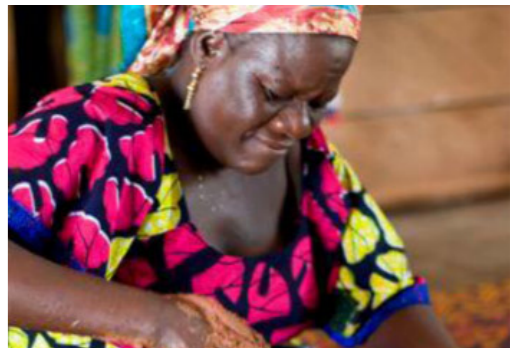
Connecting entrepreneurs to the global supply chain

At the personal level Helping people have a greater voice and live better lives SAP solutions touch hundreds of millions of lives every day, through people-centric interfaces and mobile applications. By 2015, that number will reach 1 billion.