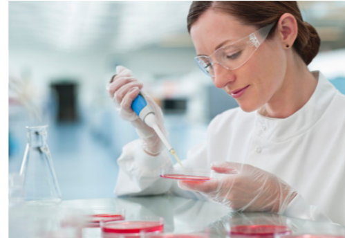
Winning the fight against Cancer

SAP HANA is disrupting traditional database technology while simplifying IT. With it, customers analyze “big data” up to 100,000 times faster than before, enabling completely new ways of doing business.