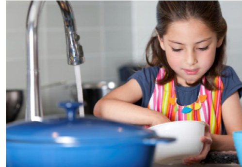
Putting consumer safety first

Our passions are teamwork, integrity, accountability, professionalism, and trust.